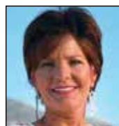
Yvette Herrell (R) Candidate for U.S. Representative, Dist. 2

5. Republican House Leadership has created the most dysfunctional Congress. The resulting chaos and disarray, including the unprecedented removal of a Speaker, have hindered progress and left many Americans underserved. New Mexico deserves better. I focus on serving the people by addressing the everyday challenges working families face. From the affordability of groceries to the availability of housing, my commitment is to deliver tangible improvements that positively impact our constituents. To restore functionality to Congress, we must reclaim the majority and elect leaders who prioritize results over chaos. It's time to shift from policies that divide and inflame toward those that create a brighter, more equitable future for all Americans.